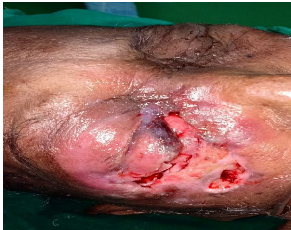
Fig-3: After tissue debridement and removal of maggots.

Vaccination for clostridium tetani was performed. On the day of admission after consent, under sedation the right orbital wound tissue debridement was done. 82 larvae were removed and kept in turpentine solution. All necrotic tissue removed, and a thorough saline was given. During postoperative period patient remained under intensive supervision and on day 2 of admission 2 to 3 larvae were removed from the wound bedside. Systemic analgesics and antibiotics were given. As the wound began to heal with no larvae seen and as the patient's general condition improved, he was discharged after 5 days.