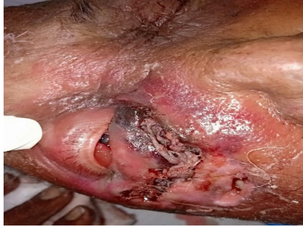
Fig-1: 70-year-old male with Orbital Myiasis right eye.