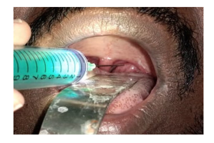
Figure 1-Fine needle aspiration from tonsil core

Next, tonsil aspiration done, using aseptic precaution, using a 10-ml syringe with, fine cyotology needle, with an average of two passes, using constant suction (Fig 1). Aspirated specimen sent to microbiology lab for culture and sensitivity examination.