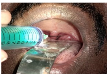
Figure 1-Fine needle aspiration from tonsil core

Next, tonsil aspiration done, using aseptic precaution, using a 10-ml syringe with, fine cytology needle, with an average of two passes, using constant suction (Fig 1). Aspirated specimen sent to microbiology lab for culture and sensitivity examination.