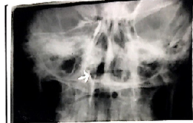
Photograph No. : 5 Dacryocystogram (A-P view) depicting normal lacrimal passage with spillage of dye in nasal cavity around a soft tissue mass.