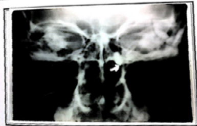
Photograph No. : 10 Dacryocystogram (A-P view) depicting complete block at lacrimal sac and nasolacrimal duct junction.